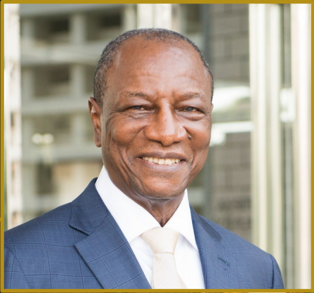
HEM the President of the Republic of Guinea, Professor Alpha Condé

The event is organized by the Private Investment Promotion Agency (APIP-Guinea) in collaboration with the African Development Bank (ADB) and the World Bank through its subsidiary the International Finance Corporation.